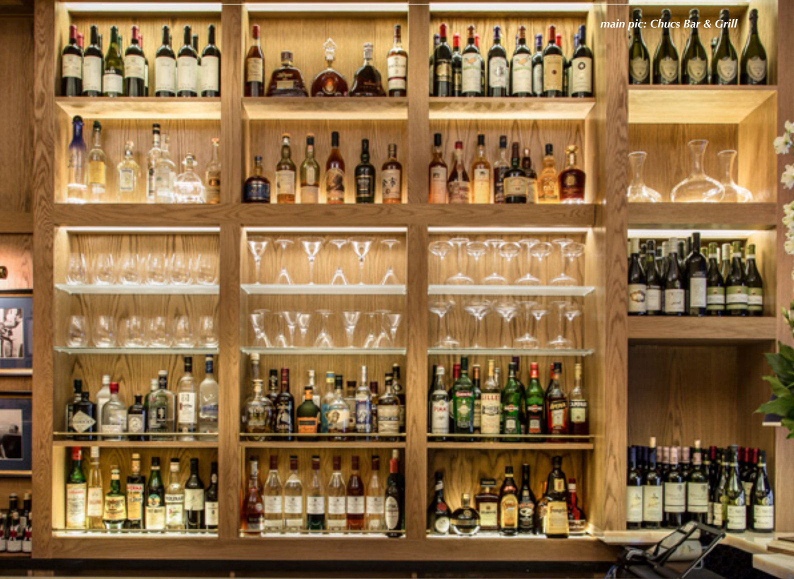
main pic: Chucs Bar & Grill