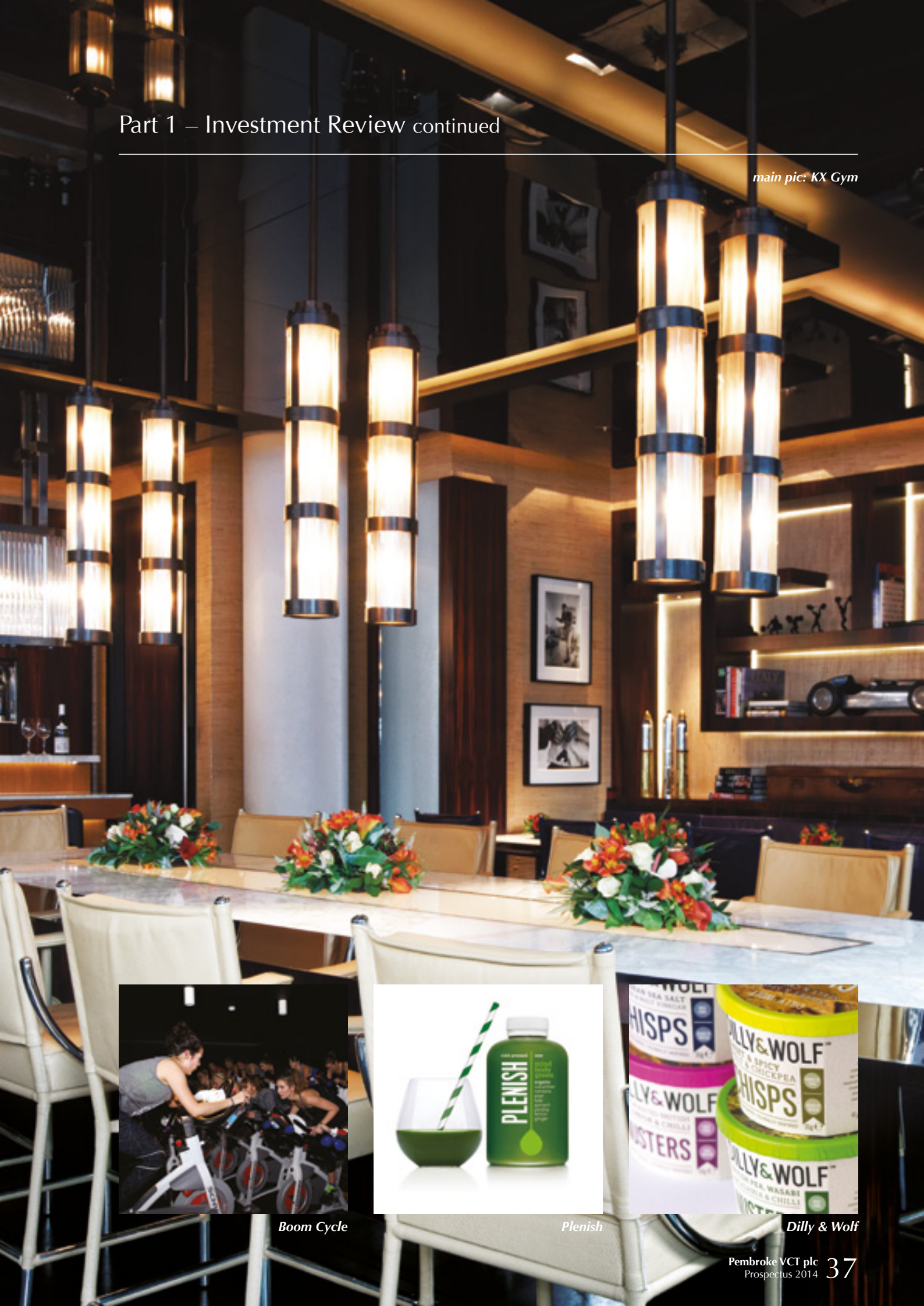
main pic: KX Gym