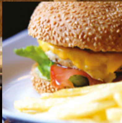
Premium fast-food restaurant chain