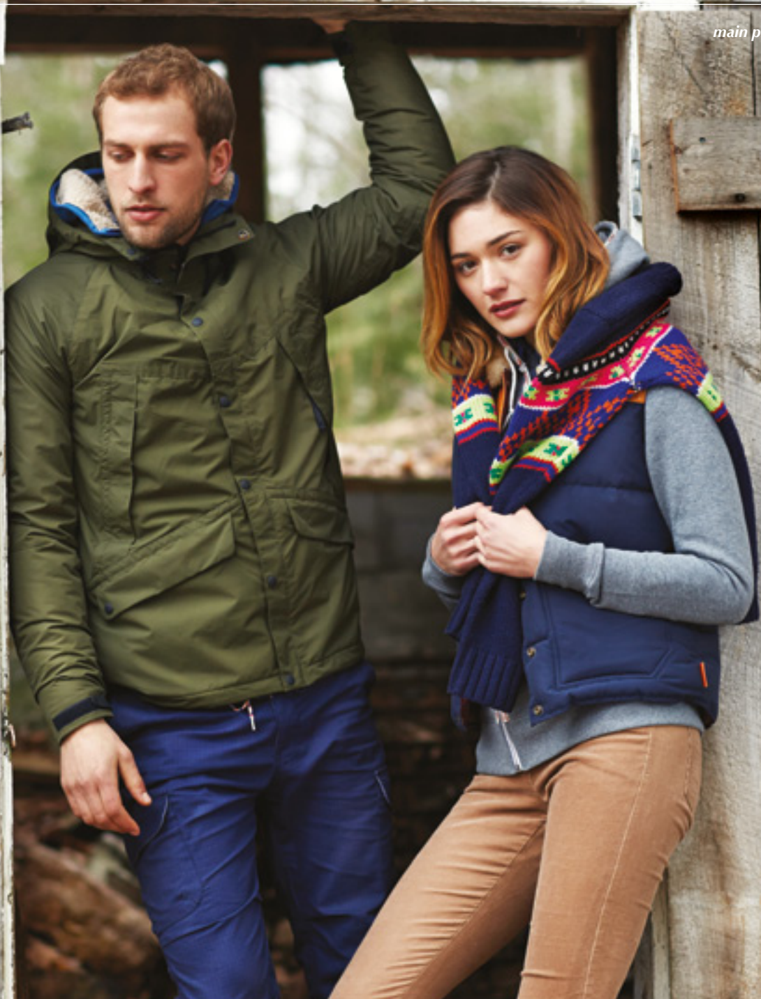
main pic: Penfield