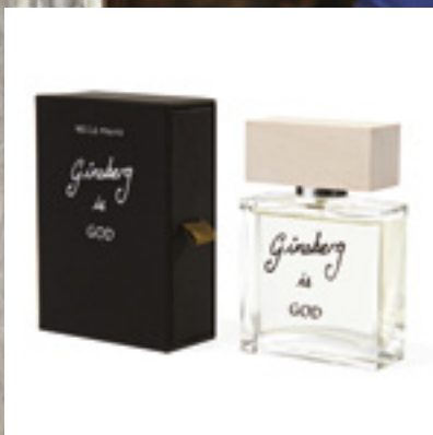
Bella Freud Perfume