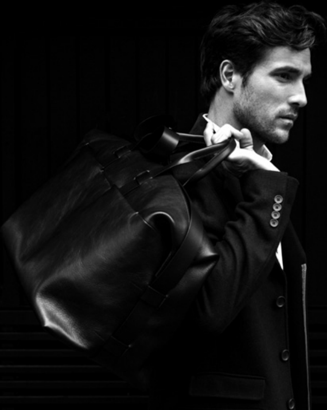
main pic: Troubadour