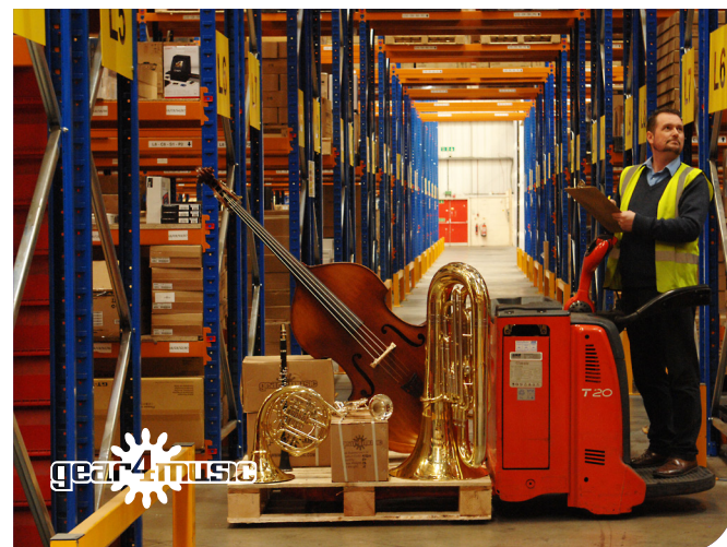
The Octopus AIM VCTs first invested in Gear4music in May 2015. Find out more on page 11 .

If you have any questions after reading this brochure, please call 0800 316 2295 or visit octopusinvestments.com . We're always happy to hear from you.