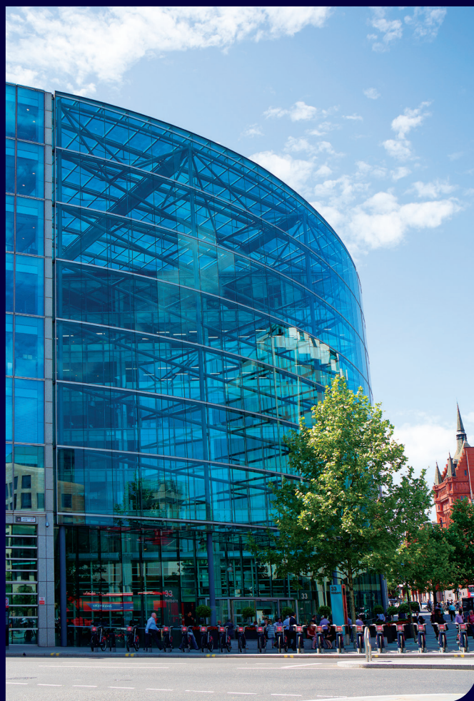
Our head office is at 33 Holborn, London.

Today we have more than 500 employees and £6.7 billion in assets under management. We work with tens of thousands of clients and we've built market-leading positions in tax-efficient investment, smaller company financing, renewable energy and healthcare. But no matter how big we get, we'll keep doing the simple things well and we'll keep looking after each of our customers, day in, day out.